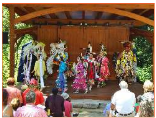
Ho Chunk Nation helps celebrate Mirror Lake State Park's 50th Anniversary

half a century, the park has seen a lot of change, but one constant has been the natural beauty that tens of thousands of visitors enjoy each year.