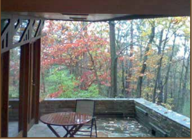
AUTUMN LEAVES FROM THE LAKE TERRACE