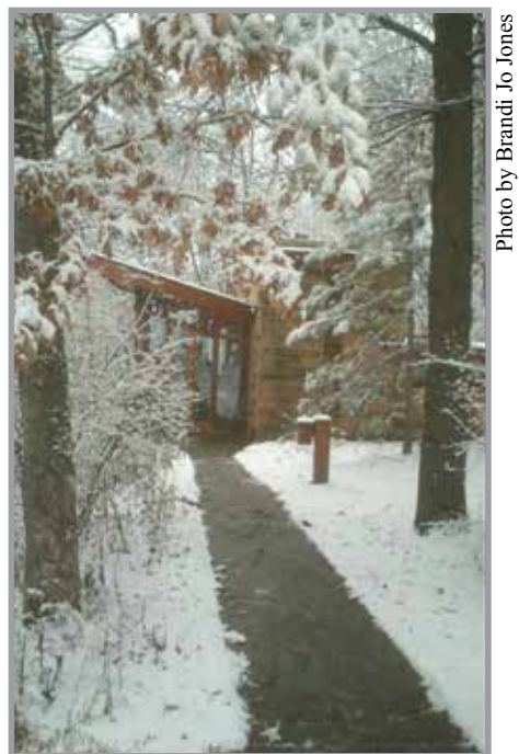
SIDEWALK IN WINTER