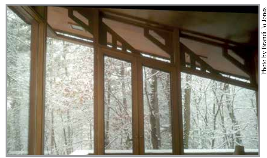
A WINTRY VIEW FROM INSIDE THE COTTAGE

Again we were taken by the light in this home–eyes wide-open light from the windows in the front room, eyes half-lidded light from the bedroom windows, and the welcome glow from the fireplace.