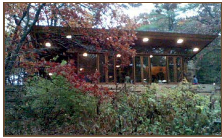
COTTAGE FRONT WITH LIGHTS