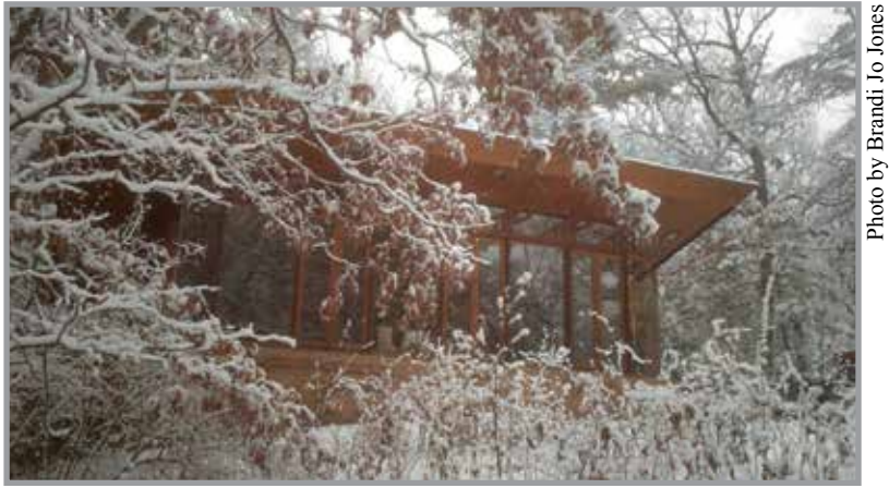
VIEW FROM THE PATH TO A FROZEN MIRROR LAKE