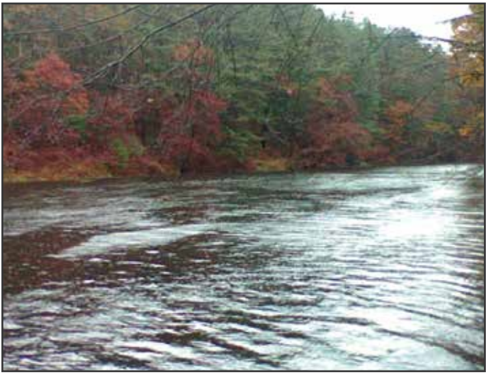
WIND IN THE NARROWS CANCELS BOAT TOUR

he Fall Color Boat Tour event was held on October 10<sup>th</sup>, following the Sunday cottage open house tours. It is always promised that "The festivities in the cottage will take place rain or shine, as will the boat tour, unless there are dangerous conditions present on the lake." This year in addition to rain, the latter came true. There was a strong wind blowing down the narrows, and the boat captains decided the boat trip was indeed dangerous under those conditions.