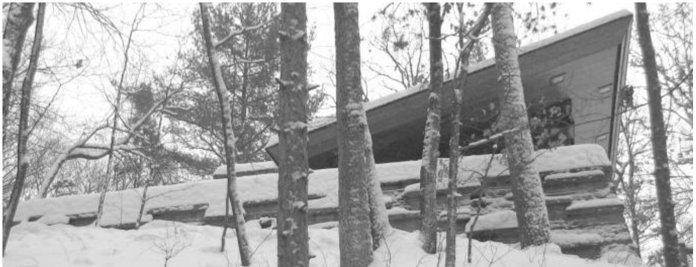
Seen from below, the cottage is reduced to a roof floating over a wall.

S pring finally arrived at the cottage after a rather strange winter season. Winter started out by being unseasonably warm, and there wasn't even snow for Christmas. Then in early February, it got very cold. Still very little snow, but temperatures were below zero at night for much of two weeks. The cottage seemed especially warm and snug then, thanks to our radiant floor heat, auxiliary forced air system, and of course roaring fires in the fireplace (with the firewood bills to prove it). As if to make up for the lack of earlier snowfall, early March roared in with what felt like all of the snow that hadn't fallen before. While taking winter pictures without leaves in the way, I saw a radically different view of our structure. Seen from below, the cottage is reduced to a roof floating over the terrace wall.